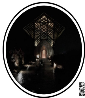
ST MICHAEL PARISH NIGHT AT THE HOLY FAMILY SHRINE